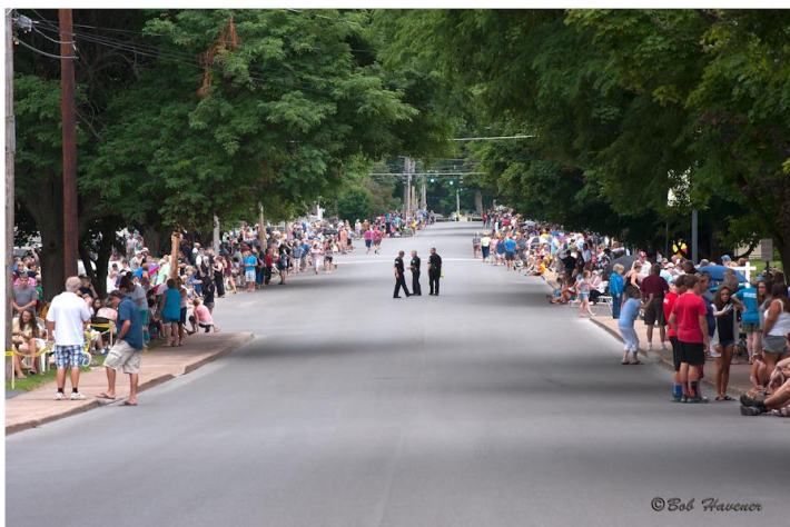
Before Sherrill Centennial Parade, Saturday July 30, 2016

The new Power & Light building construction is under way on Elmwood Place. Stop by and check it out. Enjoy the beautiful autumn weather that is on its way. God Bless and be well.