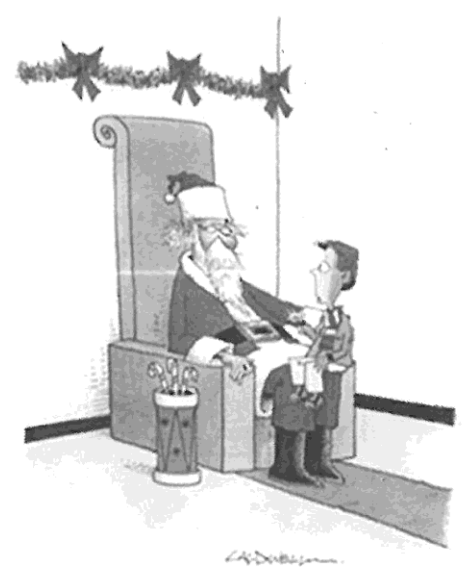
"OK. You see me when I'm sleeping. You know when I'm awake ... but no way you follow me on Twitter, right?"